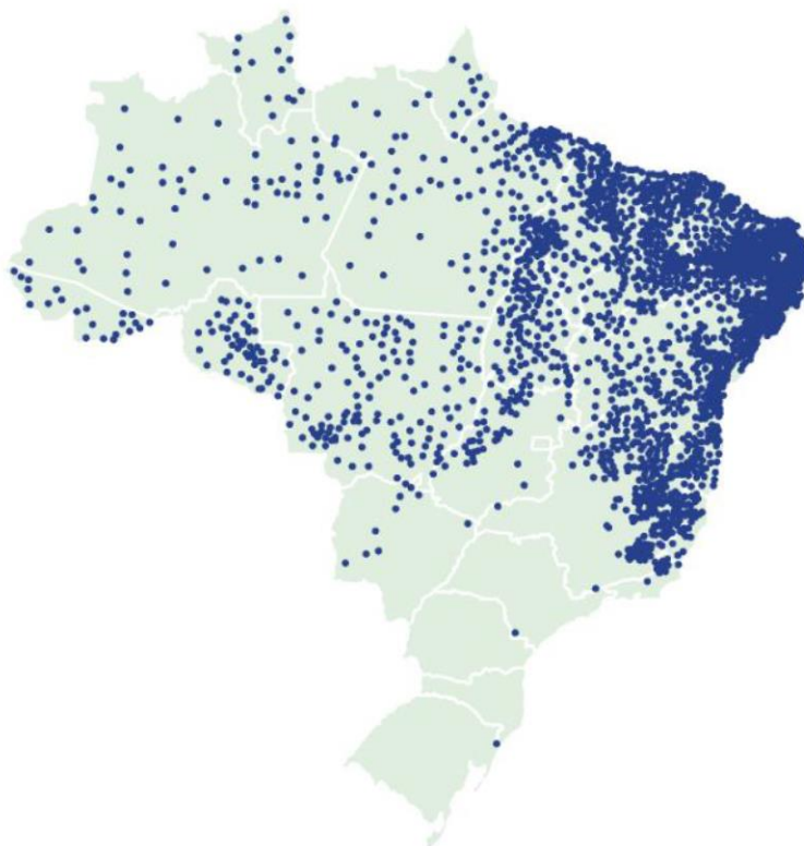
Figure 1 - Municipalities where motorcycles surpass the number of automobiles unities (2018)